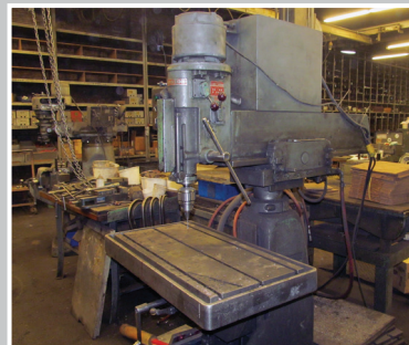
JOHANSSON Radial Drill