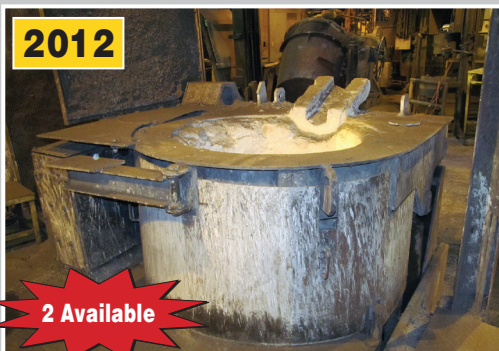
BBC ITM-4000 Coreless Induction Melting System