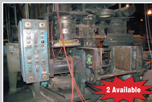
REDFORD Core Machines