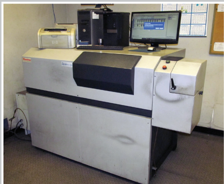
THERMO ARL 3460 Metals Analyzer