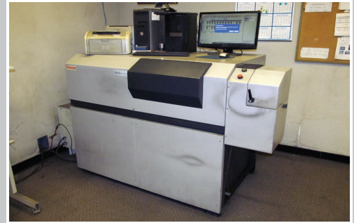
THERMO ARL 3460 Metals Analyzer

TERMS & CONDITIONS | PAYMENT: Full payment within 24 hours. Payment is Cash, Cashier's check, Certified Check, or Wire Transfer. No other forms of payments will be accepted. Full Payment Must be Made before removal of Purchase. Everything is Sold "As-Is, Where-Is" All Sales Final. Cost and Responsibility for Removal of Purchase Remains with the Purchaser. Every Effort will be Made to Facilitate Removal. While Quantities and Descriptions are Believed to be Accurate, the Auctioneer, Owners or Counsel Make no Warranties or Guarantees Either Expressed or Implied as to Authenticity, Genuineness of, or Defects in Any Lot and will not be Held Responsible for any Advertising Discrepancies or Inaccuracies. No Warranties Whatsoever are Made as to Condition Merchantability or Fitness for Use of Any Item. May we Suggest you Take Full Advantage of the Preview and Inspection Period. Sale Subject to Additions, Deletions and Prior Sales. Please Check Availability of Equipment.