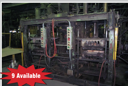
SHALCO 80HB & 85HB Cold Box Core Machines