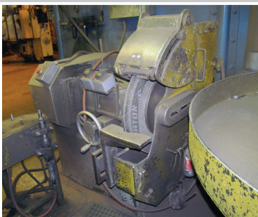
Heavy Duty Single End Grinders