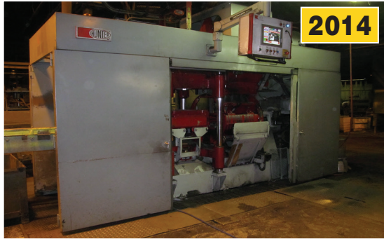
HUNTER HLM-20 Automatic Molding Machine