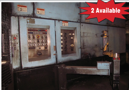
DISAMATIC 2013-MK4 Auto. Molding Machine