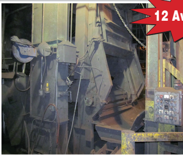
View of Wheelabrator