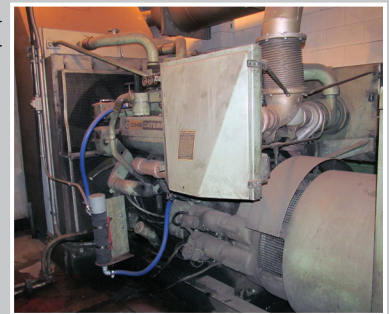
ONAN 450 kW Generator