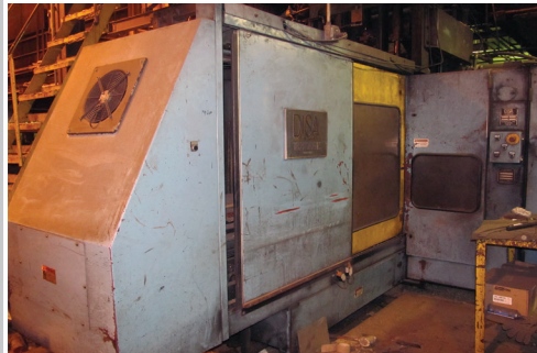
DISAMATIC Combi-Core Cold Box Core Machine