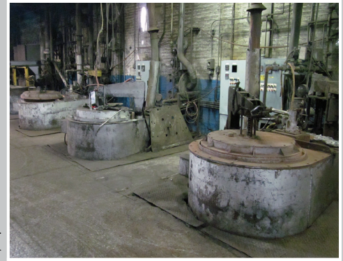
LINDBERG Heat Treat Furnaces