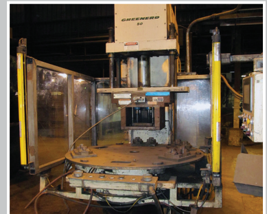
GREENERD 75-Ton Hyd. Press