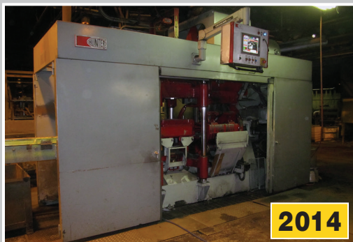
HUNTER HLM-20 Automatic Molding Machine