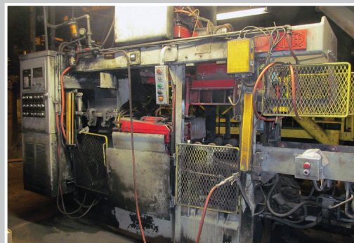
HUNTER HMP10C Automatic Molding Machine