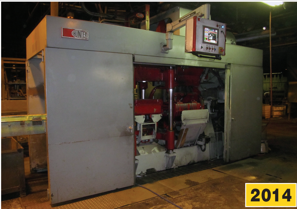
HUNTER HLM-20 Automatic Molding Machine

Pre-Auction Offers Welcome on Major Items!