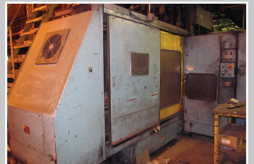
DISAMATIC Combi-Core Cold Box Core Machine

FOR INFORMATION CONTACT: Mario Mazzuca (248) 569-9781 or Charlie Winternitz (847) 272-0440