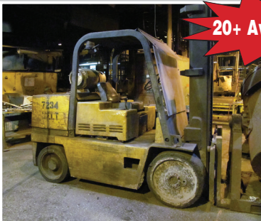
CAT 15,000 lb. T150D Diesel Forklift