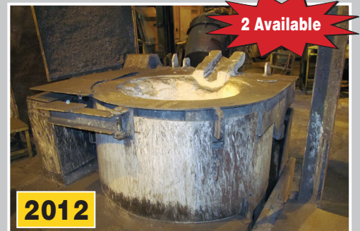
BBC ITM-4000 Coreless Induction Melting System