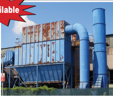
View of Dust Collector