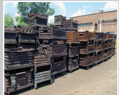
Large Quantity of Steel Inventory Bins

FOR INFORMATION CONTACT: Mario Mazzuca (248) 569-9781 or Charlie Winternitz (847) 272-0440