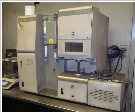
LECO CS230 Carbon Sulfur Determinator