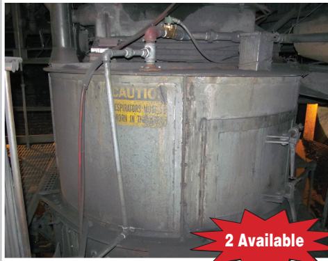
B&P 85B Speed Muller