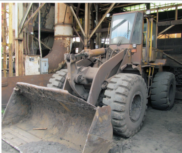
CAT 936F Wheel Loader