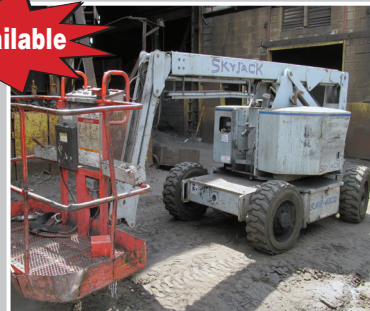
SKYJACK SJKB-33N Boom Lift