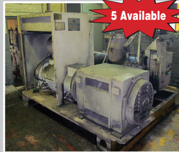
GARDNER DENVER Air Compressor