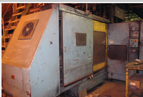
DISAMATIC Combi-Core Cold Box Core Machine