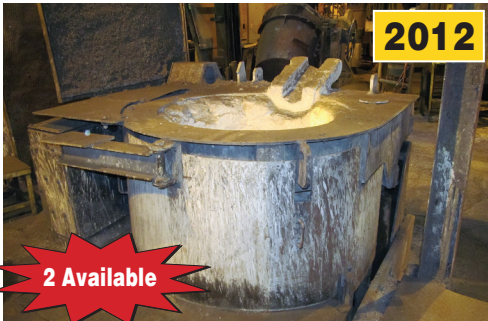
BBC ITM-4000 Coreless Induction Melting System

21700 Northwestern Hwy. Suite 1180 Southfield, MI 48075