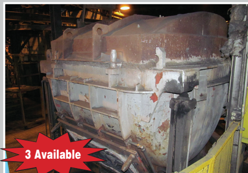
BBC IRB-6 Vert. Channel Induction Holding Furnace